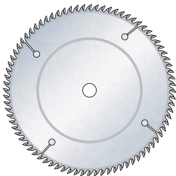
Type NFT - Thin Wall Extrusion